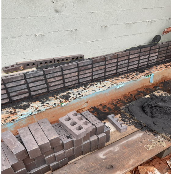
Began installing black brick at the front vestibule area