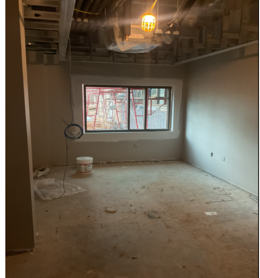
Begin installing new windows and window frames