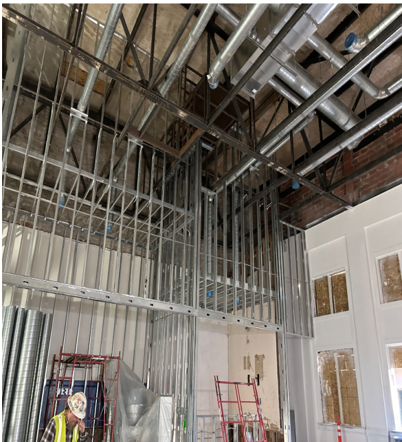
Continue Spiral duct install in the media center