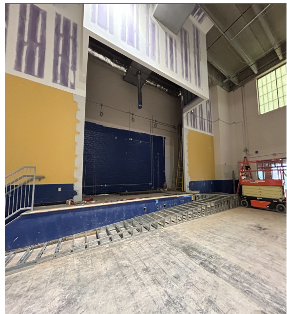
Gym stage ramp metal stud framing is nearly complete